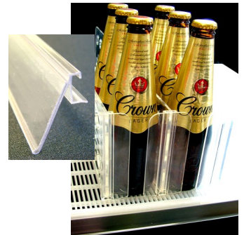
Fast Feed Scanstrip