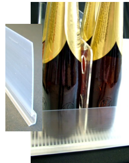
Rear Topple Bar

The rear topple bar prevents stock sliding out the back of the shelf and the front scanstrip provides display area for tickets and barcodes.