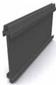
Double Sided Profile