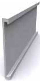
Single Sided Profile