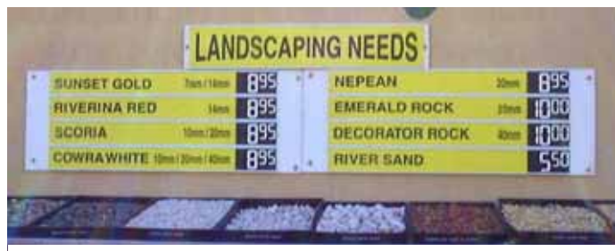
Pivot Pricer Channel in a Garden Centre