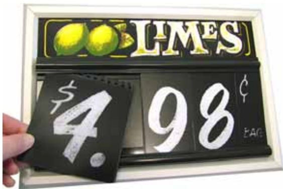
2 row ticket frame