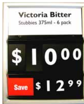
3 row ticket frame