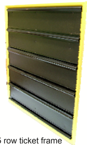
5 row ticket frame