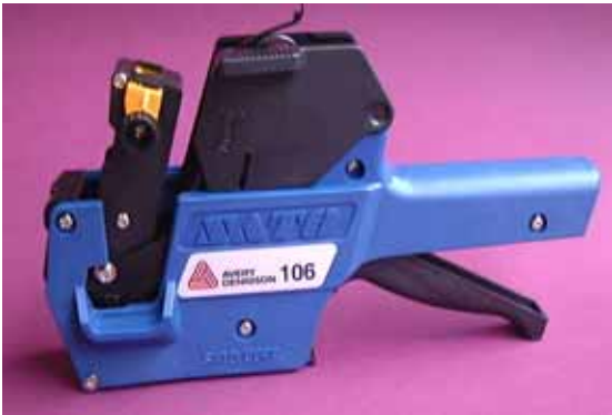
SATO 1 LINE 6 & 7 DIGIT PRICE GUNS Economical and user friendly price gun. Available in 4 different configurations.