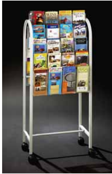
40 Trifold A-TR40TF

Expanda brochure trolleys are designed with flexibility in mind.