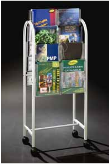
16 A4 A-TR16A4