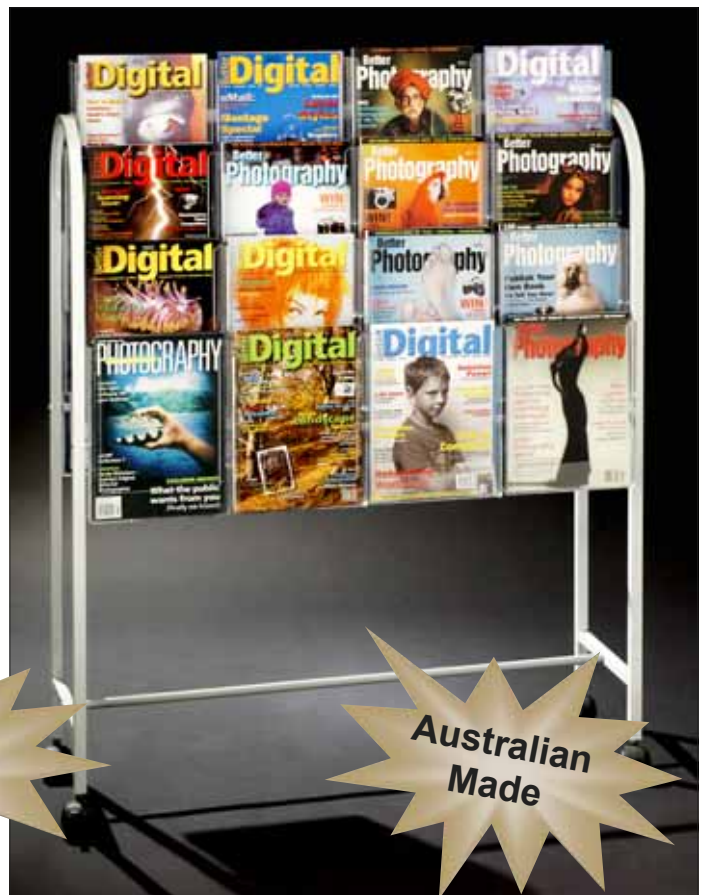
Large trolley with 32 A4 brochure holders A-TR32A4