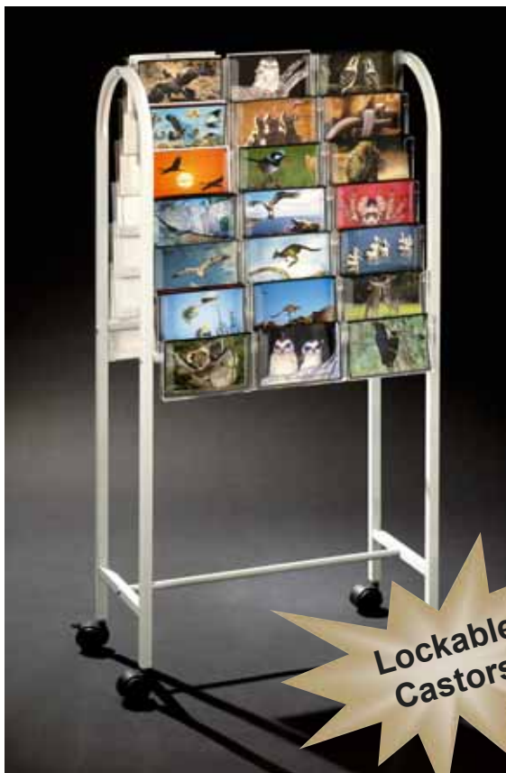
42 Horizontal Postcard A-TR42P